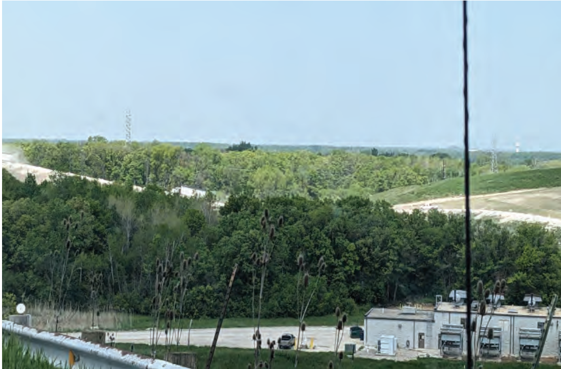
Long access road to North Expansion West