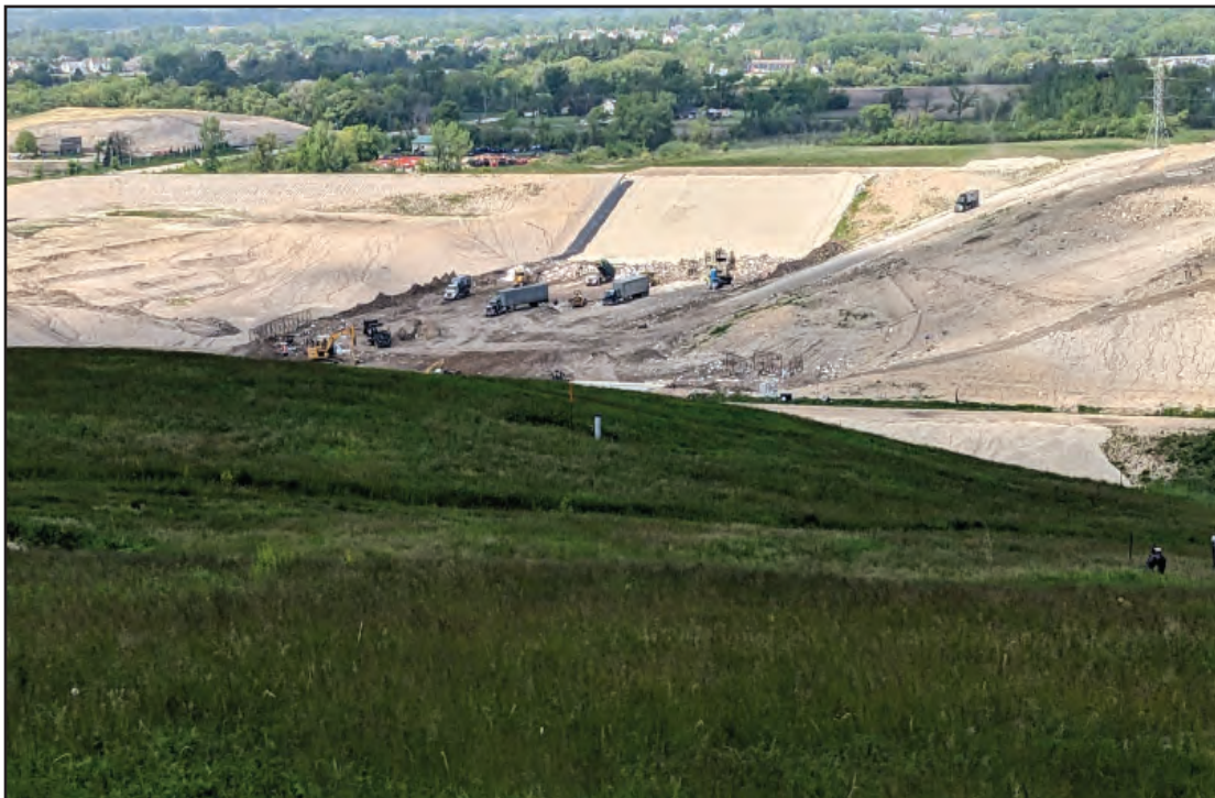
Fluff layer reaching ~80% of coverage