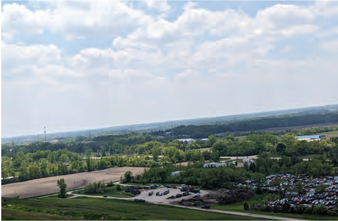
Overview of Resi-drop-off