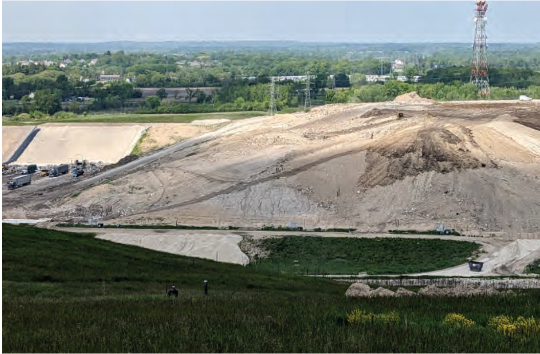
East slope of Phase 2 into new cell Phase 3