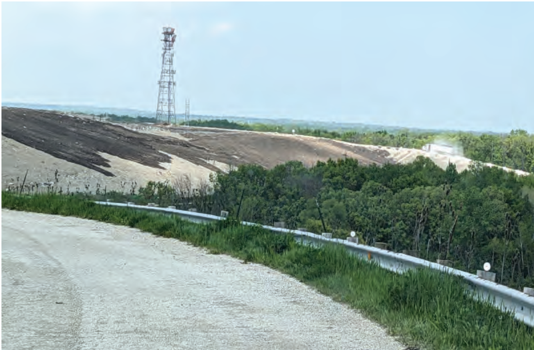
Additional intermediate cover being added to North Expansion West slopes