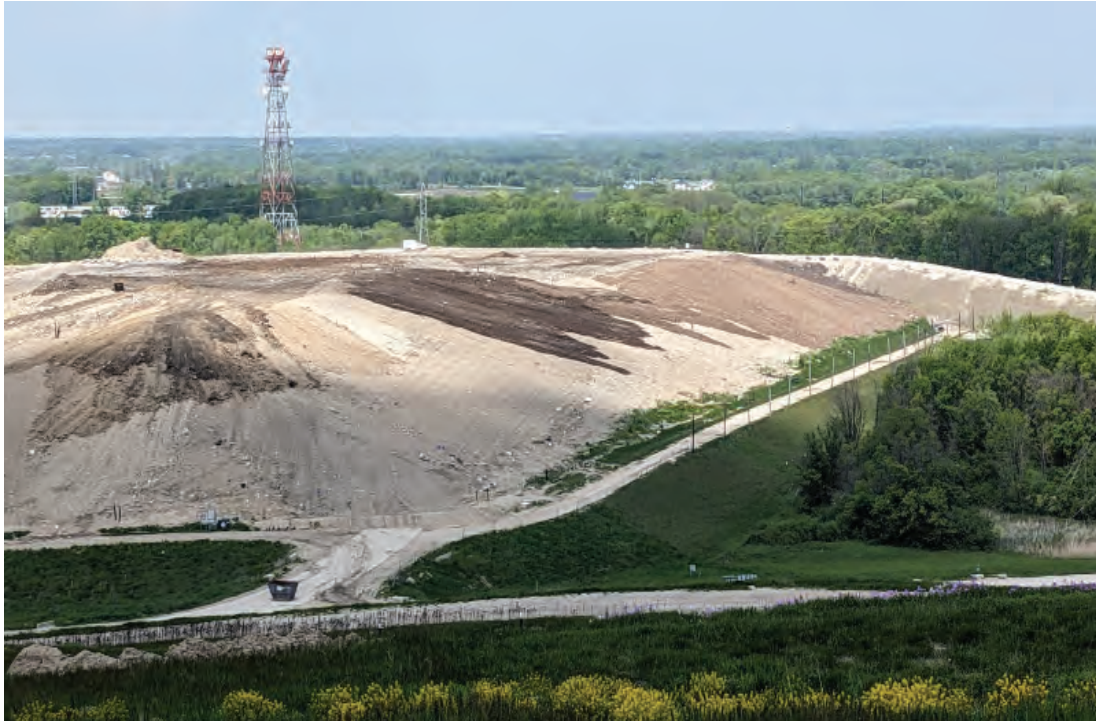
Phase 2 of North Expansion West, well covered and new intermediate cover