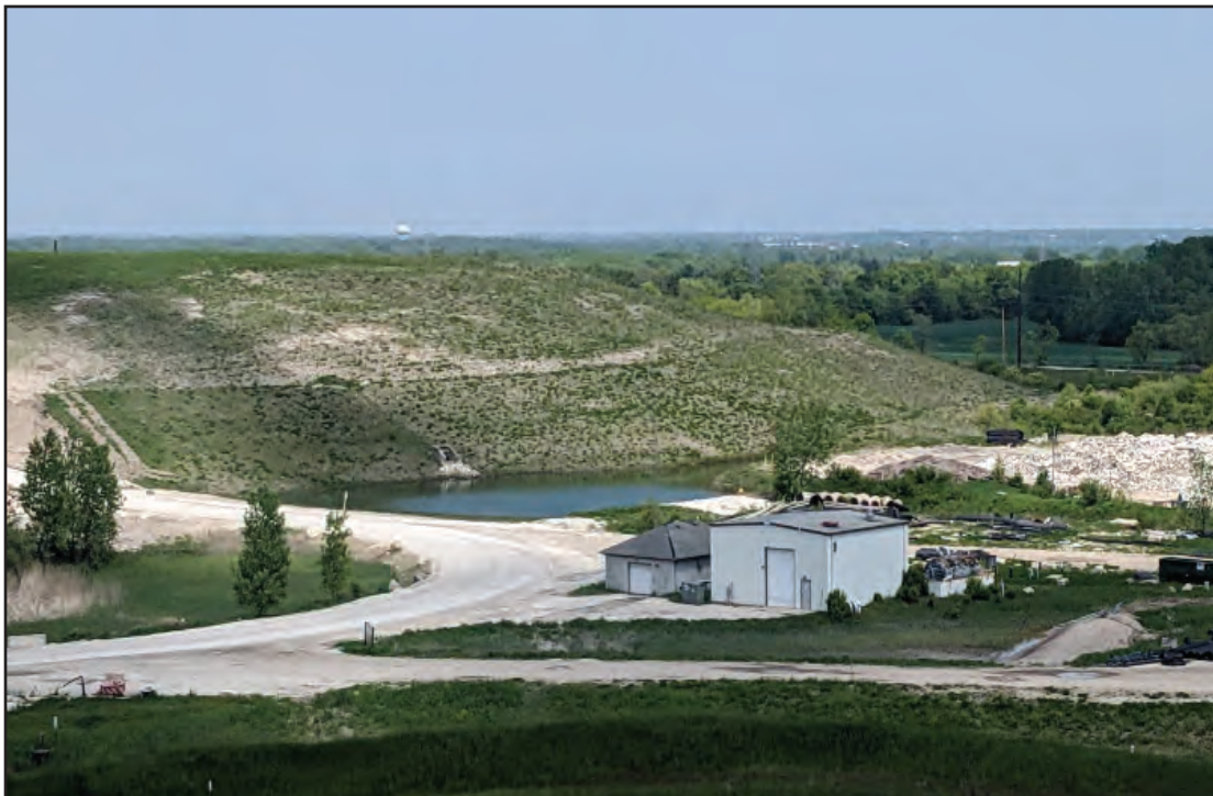
Stockpile vegetation starting up