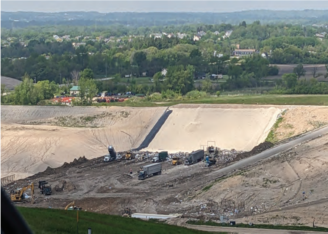
Continued placement of fluff layer in new cell, Phase 3 of North Expansion West