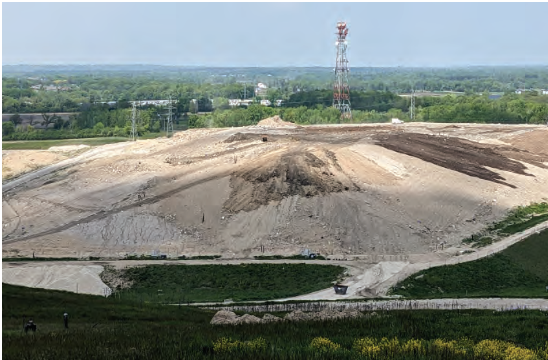
Overview of Phases 1 and 2